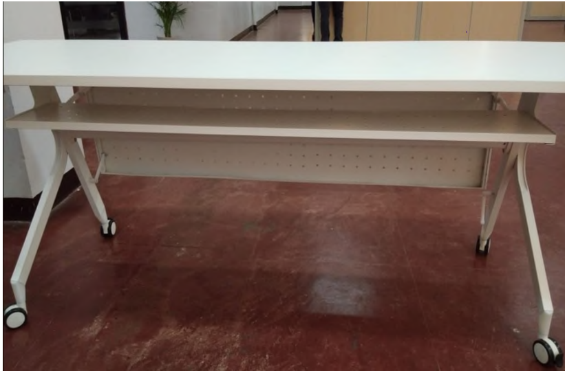
Item # 1