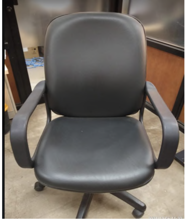
Item # 3