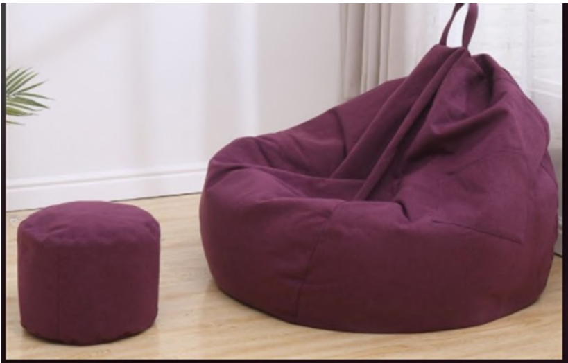
Item # 4