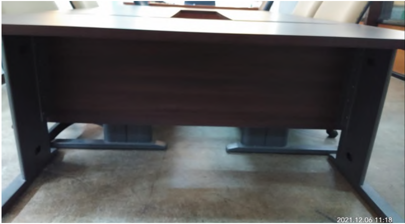
Item # 2