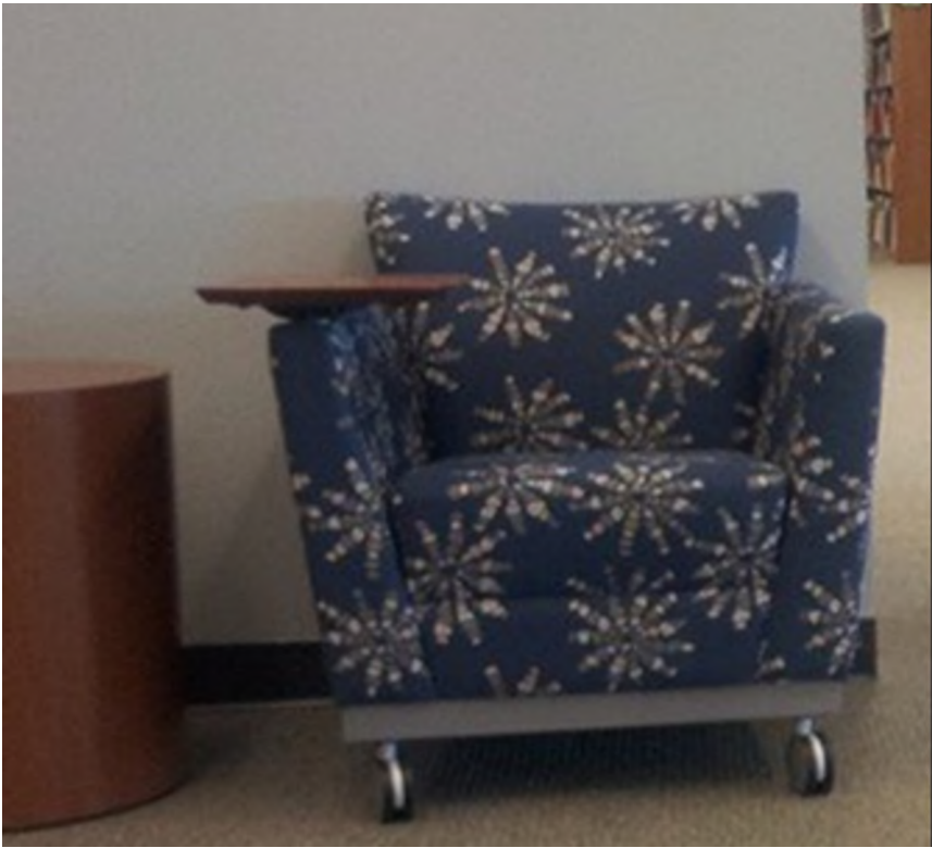
Item # 5